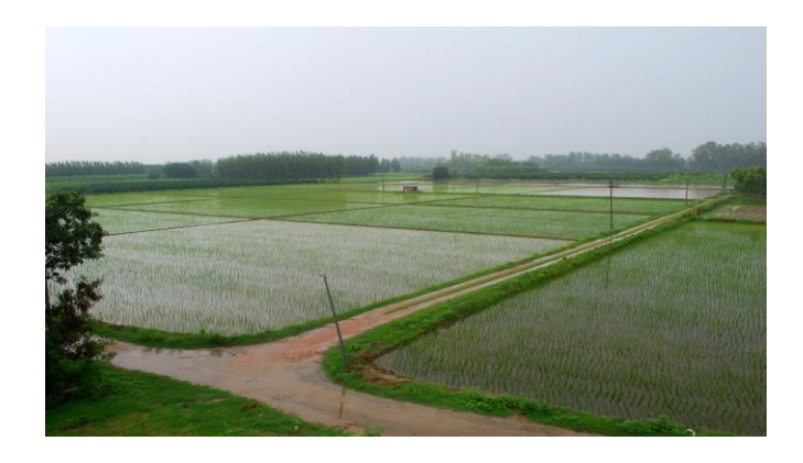
The state of Punjab led India's Green Revolution and earned the distinction of being the country's bread basket.

India is the largest exporter of cashew kernels and cashew nut shell liquid (CNSL). Foreign exchange earned by the country through the export of cashew kernels during 2011–12 reached ₹43.9 billion (equivalent to ₹70 billion or US$920 million in 2020) based on statistics from the Cashew Export Promotion Council of India (CEPCI). 131,000 tonnes of kernels were exported during 2011–12.[5,6]